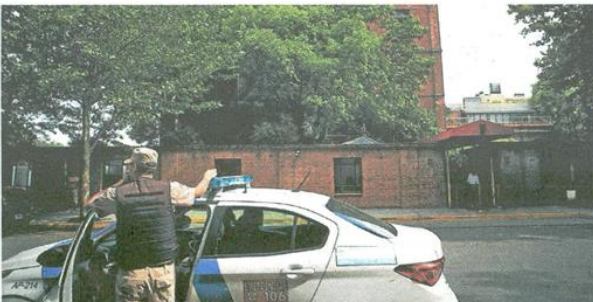
CRIME IN THE CAPITAL: ATTACK ON BRITISH TOURIST RAISES QUESTIONS — BY CARLY GRAF — PAGE 12