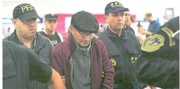
'THE BUTCHER OF ESMA': ALLEGED DICTATORSHIP TORTURER EXTRADITED FROM FRANCE — PAGE 8